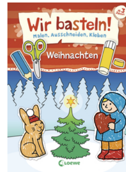
Let's Do Arts & Crafts! - Christmas