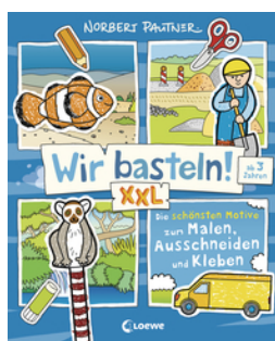
Let's Do Arts & Crafts! XXL - The most beautiful designs to paint, cut out and glue (blue)