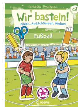
Let's Do Arts and Crafts! - Football