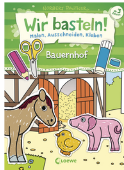
Let's Do Arts and Crafts! - Farm