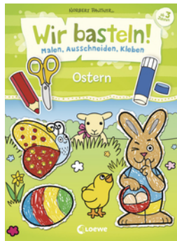
Let's Do Arts and Crafts! - Easter