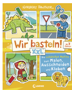
Let's do Arts and Crafts! XXL - The most beautiful designs to paint, cut out and glue (yellow)