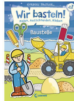
Let's Do Arts and Crafts! - Construction Site