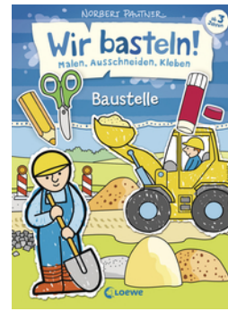
Let's Do Arts and Crafts! - Construction Site