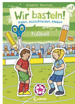
Let's Do Arts and Crafts! - Football