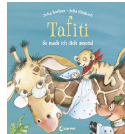
Tafiti – That’s How You Get Well