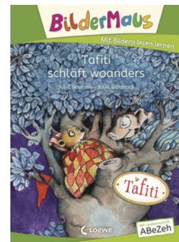
Picture Mouse - Tafiti Sleeps Somewhere Else