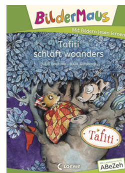
Picture Mouse - Tafiti Sleeps Somewhere Else