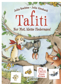
Tafiti – Be Brave, Little Bat!