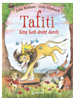
Tafiti – King Kofi Goes Crazy