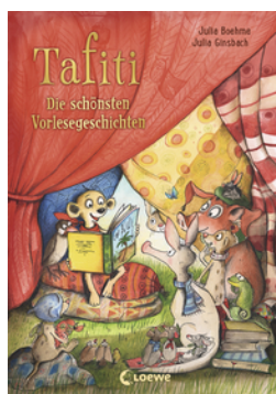
Tafiti – The Best Story Time Adventures for Reading Together