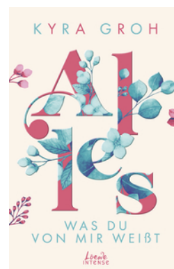
All That You Know About Me