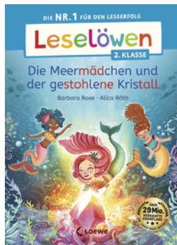
Reading Lions (Year 2) – The Sea Girls and the Stolen Crystal