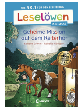
Reading Lions (Year 2) - Secret Mission at the Riding Stable