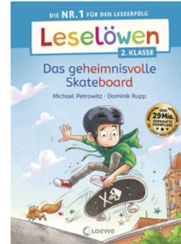
Reading Lions (Year 2) – The Mysterious Skateboard