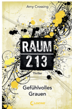
Room 213 – Emotional Horror