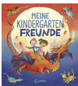
My Kindergarten Friends - Dragons