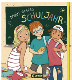
My First Year of School