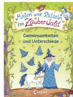
Drawing and Puzzle-solving in the Enchanted Forest - Similarities and Differences