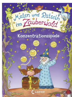
Drawing and Quiz-Solving in the Enchanted Forest - Concentration