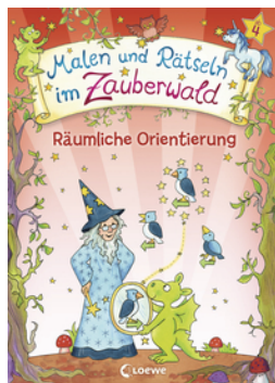
Drawing and Quiz-Solving in the Enchanted Forest - Spatial Orientation