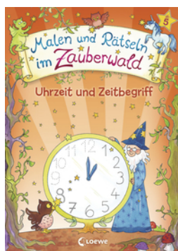
Drawing and Puzzle-solving in the Enchanted Forest - Time