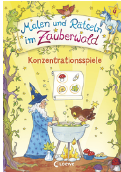
Drawing and Puzzle-solving in the Enchanted Forest - Concentration Games