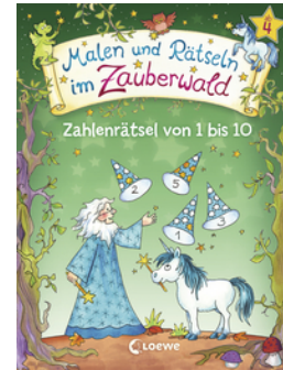
Drawing and Puzzle-solving in the Enchanted Forest - Number Puzzles from 1 to 10