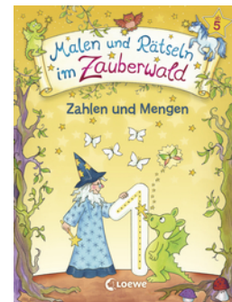
Drawing and Quiz-Solving in the Enchanted Forest - Numbers and Quantities