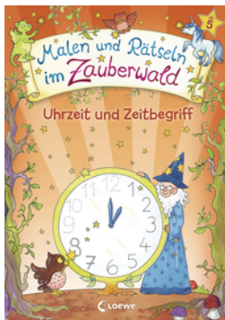
Drawing and Puzzle-solving in the Enchanted Forest - Time