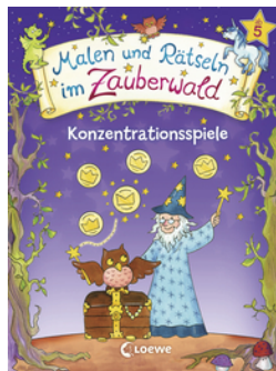
Drawing and Quiz-Solving in the Enchanted Forest - Concentration