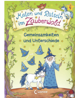
Drawing and Puzzle-solving in the Enchanted Forest - Similarities and Differences