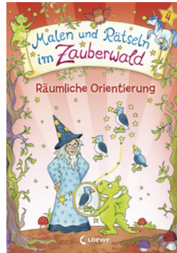
Drawing and Quiz-Solving in the Enchanted Forest - Spatial Orientation