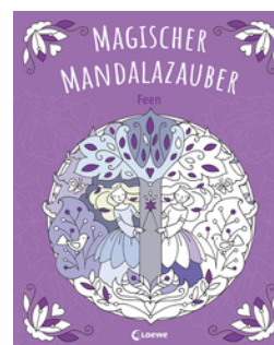
Enchanting Mandala Magic – Fairies