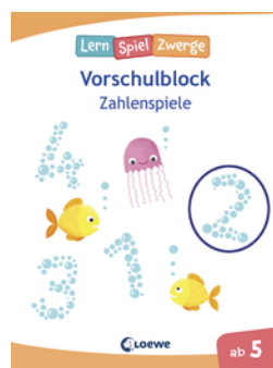
Little Quiz Dwarfs - Number Games