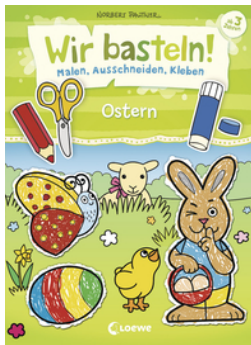
Let's Do Arts and Crafts! - Easter