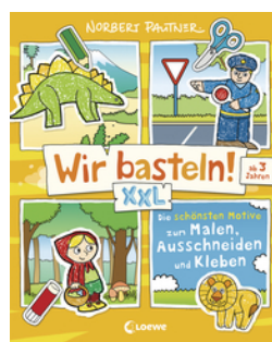
Let's do Arts and Crafts! XXL - The most beautiful designs to paint, cut out and glue (yellow)