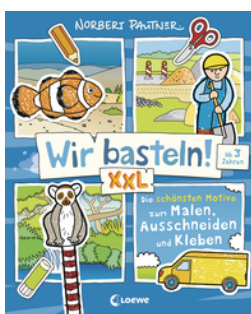
Let's Do Arts & Crafts! XXL - The most beautiful designs to paint, cut out and glue (blue)