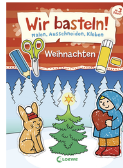
Let's Do Arts & Crafts! - Christmas