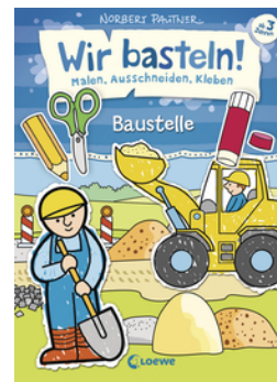
Let's Do Arts and Crafts! - Construction Site