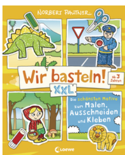
Let's do Arts and Crafts! XXL - The most beautiful designs to paint, cut out and glue (yellow)