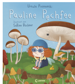
Pauline the Flop-Fairy