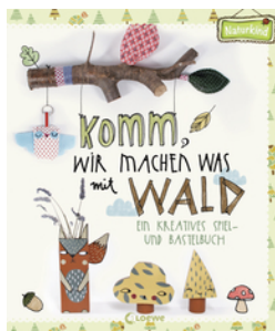
Let's Make Something with Wood