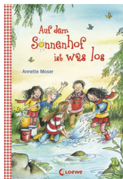
Sunny Farm – Something's up on Sunny Farm (Vol. 3)