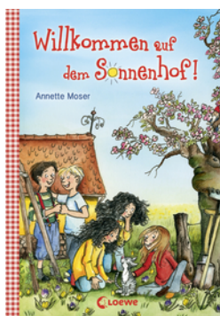
Sunny Farm – Welcome to Sunny Farm! (Vol. 1)