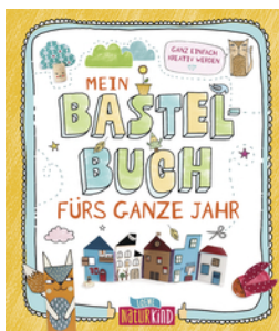
My Craft Book for the Whole Year