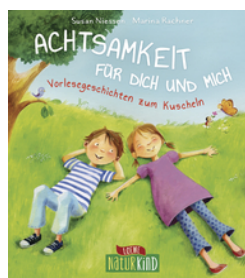
Attentiveness for All of Us! – Story Time is Cuddle Time!