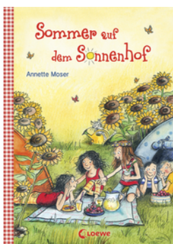
Sunny Farm – Summer on Sunny Farm (Vol. 2)