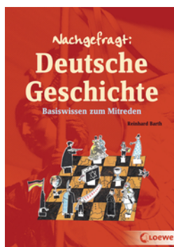
Guide to German History