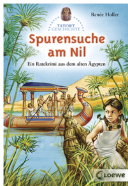
History Mysteries - Robbers on the Nile