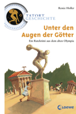
History Mysteries - Under the Eyes of the Gods