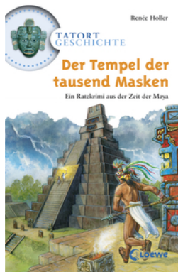
History Mysteries - The Temple of Thousand Masks