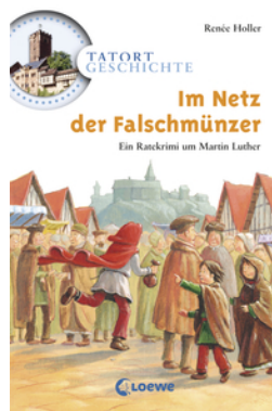
History Mysteries - Caught in the Forger's Web