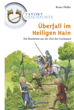
History Mysteries - Attack in the Sacred Grove