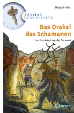
History Mysteries - The Shaman's Oracle