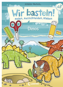
Let's Do Arts & Crafts! - Dinosaurs