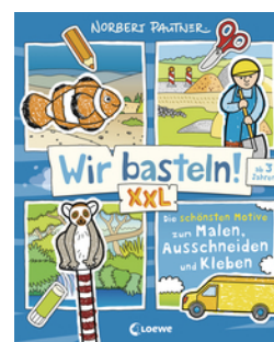
Let's Do Arts & Crafts! XXL - The most beautiful designs to paint, cut out and glue (blue)