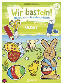
Let's Do Arts and Crafts! - Easter