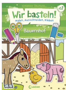
Let's Do Arts and Crafts! - Farm