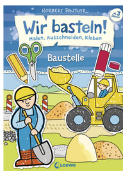
Let's Do Arts and Crafts! - Construction Site