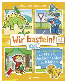
Let's do Arts and Crafts! XXL - The most beautiful designs to paint, cut out and glue (yellow)