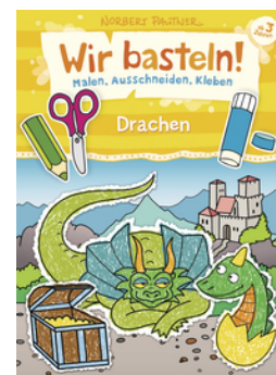
Let's Do Arts & Crafts! - Dragons