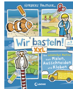
Let's Do Arts & Crafts! XXL - The most beautiful designs to paint, cut out and glue (blue)