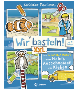
Let's Do Arts & Crafts! XXL - The most beautiful designs to paint, cut out and glue (blue)