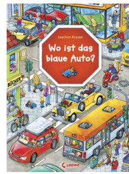
Can You Find the Blue Car?