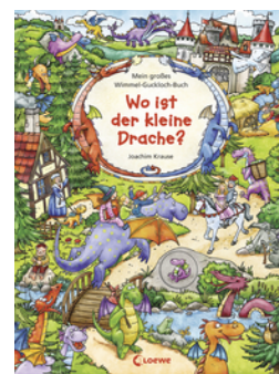
Where Is ... The Little Dragon?