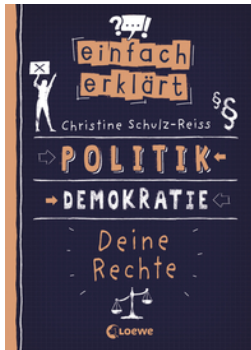
Simply Explained – Politics, Democracy, Your Rights