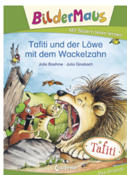
PictureMouse - Tafiti and the Lion with the Wobbly Tooth