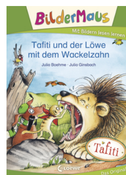
PictureMouse - Tafiti and the Lion with the Wobbly Tooth