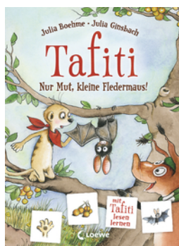
Tafiti – Be Brave, Little Bat!