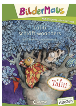
Picture Mouse - Tafiti Sleeps Somewhere Else