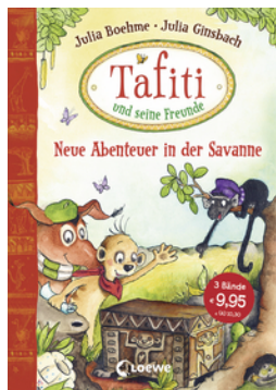
Tafiti and His Friends - New Adventures in the Savannah (Vol. 4-6)