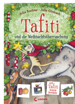
Tafiti - The Christmas Surprise