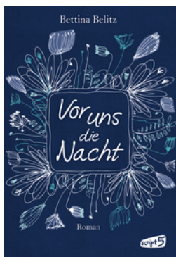
The Night Lies Ahead