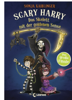
Scary Harry – The Skeleton with the Golden Scythe (Vol. 9)