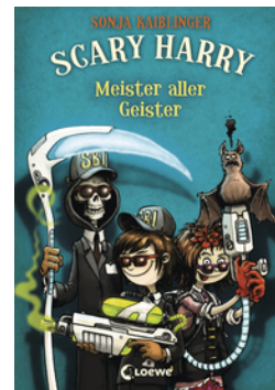
Scary Harry – Master of All Ghosts (Vol. 3)