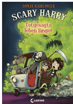
Scary Harry – The Reported Dead Live Longer (Vol. 2)