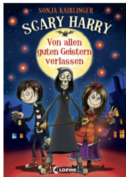
Scary Harry – Takes Leave of his Senses (Vol. 1)