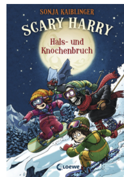
Scary Harry – Break a Legbone (Vol. 6)