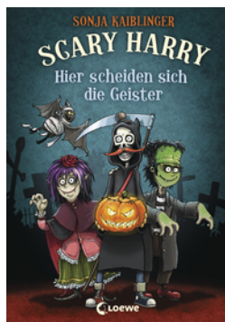
Scary Harry – Strife Among the Spooks (Vol. 5)