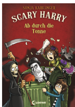
Scary Harry – Down the Can (Vol. 4)