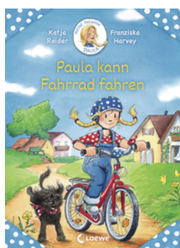
My best friend Paula - Paula can ride a bike