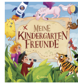
My Kindergarten Friends - Magical Creatures, Animals & Co.