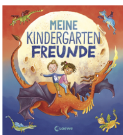
My Kindergarten Friends - Dragons