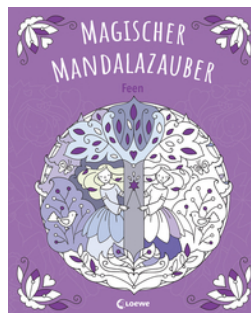
Enchanting Mandala Magic – Fairies