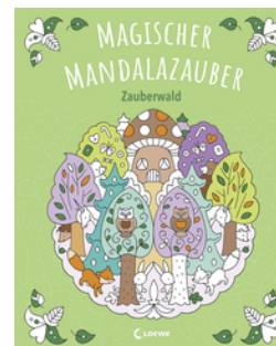
Enchanting Mandala Magic – Magical Forest