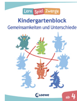
Little Quiz Dwarfs - Similarities and Differences