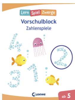
Little Quiz Dwarfs - Number Games