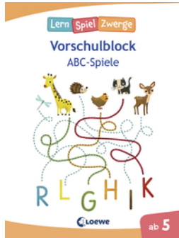
Little Quiz Dwarfs - ABC Games