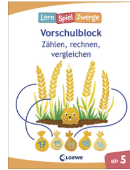
Little Quiz Dwarfs - Counting, Calculating, Comparing