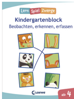
Little Quiz Dwarfs - Perception