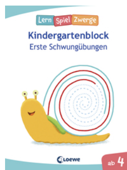
Little Quiz Dwarfs - First Swin Exercises (Writing)