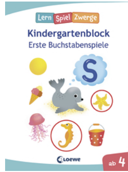
Little Quiz Dwarfs - First Letter Games