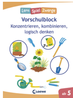
Little Quiz Dwarfs - Logic Games