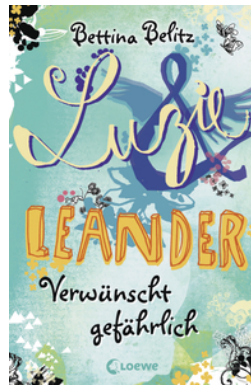
Lucie & Leander – Dangerously Accursed (Vol. 5)