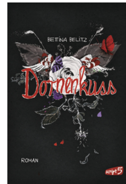
A Thorned Kiss (Vol. 3)