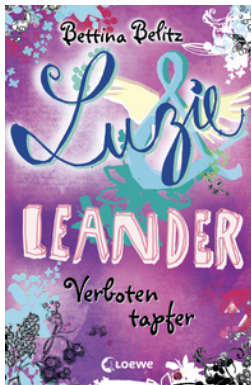
Lucie & Leander - Courageously Wicked (Vol. 6)