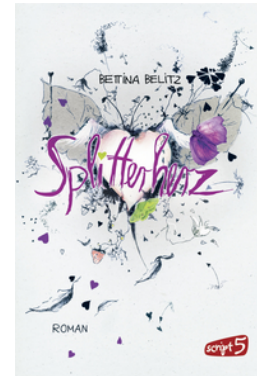
A Splintered Heart (Paperback Edition)