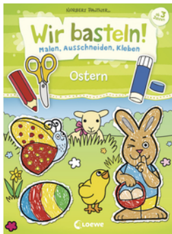
Let's Do Arts and Crafts! - Easter