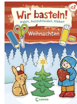
Let's Do Arts & Crafts! - Christmas