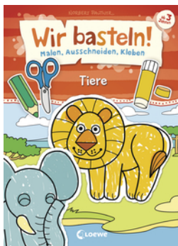
Let's Do Arts & Crafts! 5+ - Painting, Cutting out, Gluing Animals