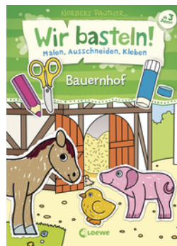
Let's Do Arts & Crafts! 5+ - Painting, Cutting out, Gluing Farm