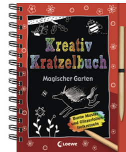
Creative Scratch Book - Magical Garden