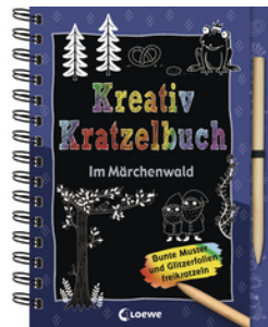
Creative Scratching - Tales' Forest