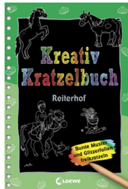
Creative Scratch Book - Riding School