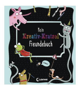
Creative Scratching Friendship Album