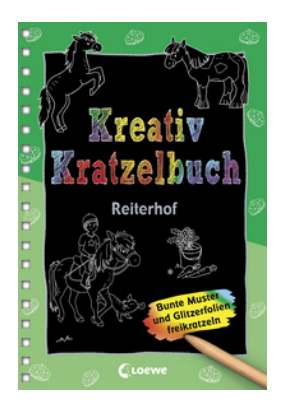
Creative Scratch Book - Riding School