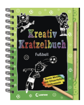
Creative Scratch Book - Soccer