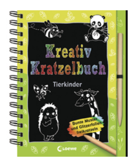
Creative Scratching - Animal Kids