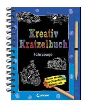
Creative Scratch Book - Vehicles