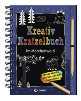
Creative Scratching - Tales' Forest