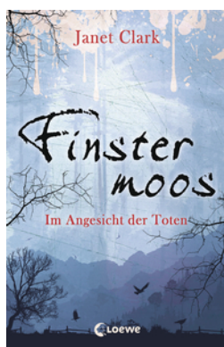
Finstermoos – At Death's Door (Vol. 3)