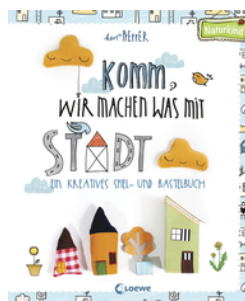
Let's Make Something in Town