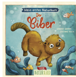
My First Naturebook – The Beaver