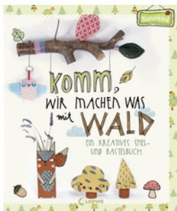
Let's Make Something with Wood