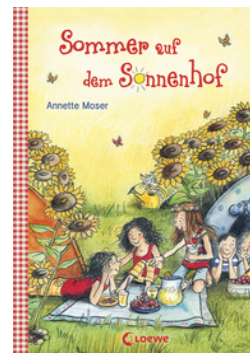
Sunny Farm – Summer on Sunny Farm (Vol. 2)