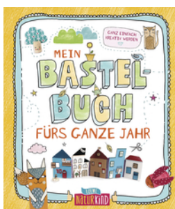
My Craft Book for the Whole Year