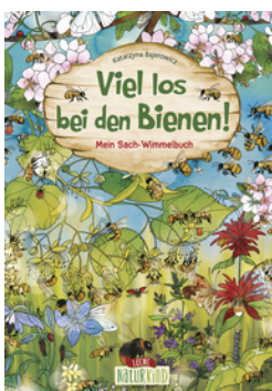
Let's Go Explore the Bees! - My non-fiction Search and Find book