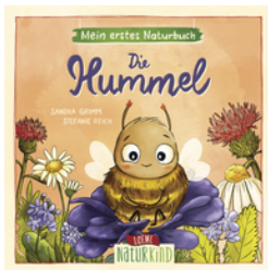
My First Naturebook – The Bumblebee