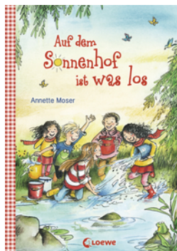
Sunny Farm – Something's up on Sunny Farm (Vol. 3)