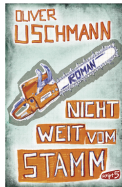
Chip off the Old Block