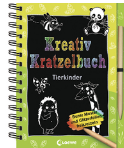
Creative Scratching - Animal Kids