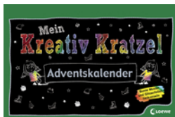
Creative Scratching: Advent Calendar