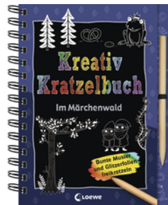
Creative Scratching - Tales' Forest