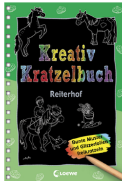
Creative Scratch Book - Riding School