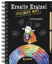
Creative Scratch Pocket Art: A Rainbow of Colour