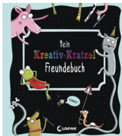
Creative Scratching Friendship Album