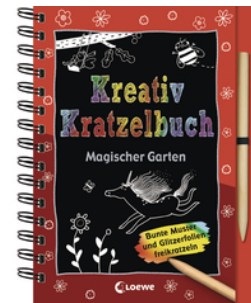
Creative Scratch Book - Magical Garden