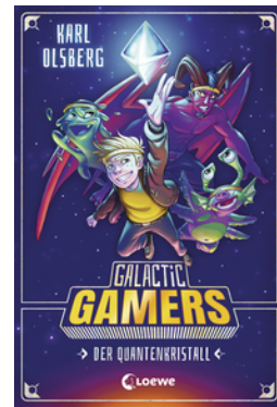
Galactic Gamers - The Quantum Cristal (Vol. 1)