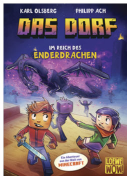
The Villagers - In the Empire of the Enderdragon (Vol. 4)