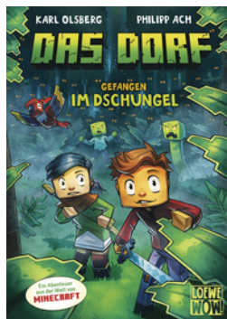
The Villagers - Trapped in the Jungle (Vol. 3)