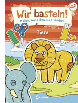
Let's Do Arts and Crafts! - Animals