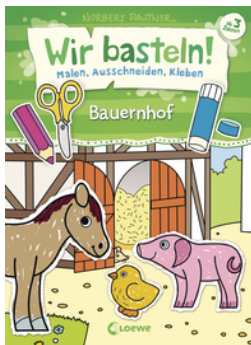
Let's Do Arts and Crafts! - Farm