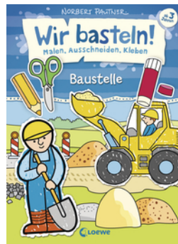
Let's Do Arts and Crafts! - Construction Site