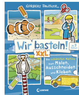
Let's Do Arts & Crafts! XXL - The most beautiful designs to paint, cut out and glue (blue)