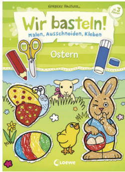
Let's Do Arts and Crafts! - Easter