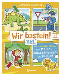
Let's do Arts and Crafts! XXL - The most beautiful designs to paint, cut out and glue (yellow)