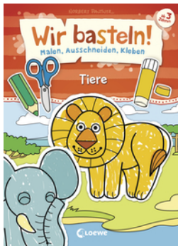
Let's Do Arts and Crafts! - Animals