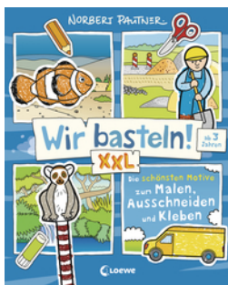
Let's Do Arts & Crafts! XXL - The most beautiful designs to paint, cut out and glue (blue)