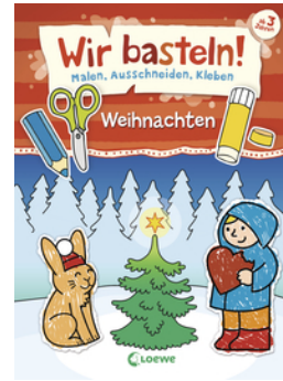
Let's Do Arts & Crafts! - Christmas