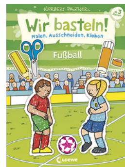
Let's Do Arts and Crafts! - Football