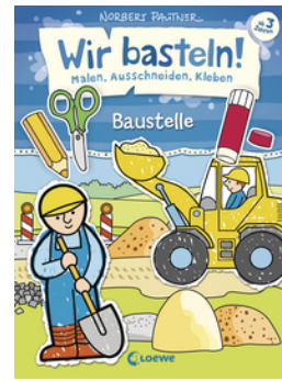
Let's Do Arts and Crafts! - Construction Site