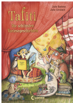
Tafiti – The Best Story Time Adventures for Reading Together