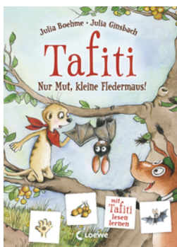
Tafiti – Be Brave, Little Bat!