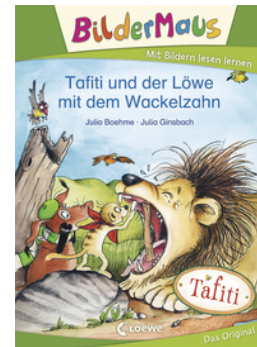
PictureMouse - Tafiti and the Lion with the Wobbly Tooth