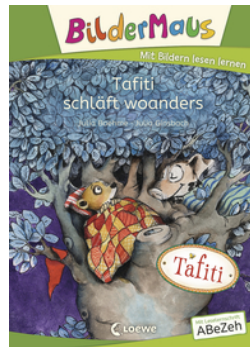
Picture Mouse - Tafiti Sleeps Somewhere Else