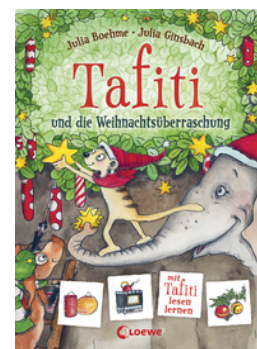
Tafiti - The Christmas Surprise