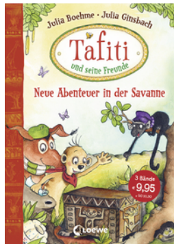
Tafiti and His Friends - New Adventures in the Savannah (Vol. 4-6)