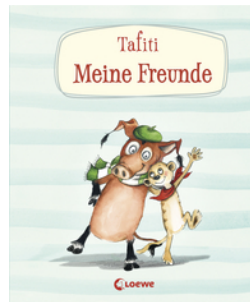
My Friends - Tafiti