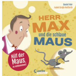
Mr. Max and the Clever Mouse