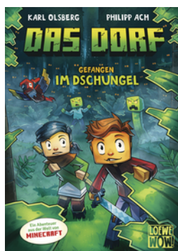
The Villagers - Trapped in the Jungle (Vol. 3)