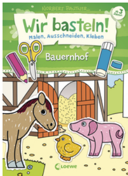
Let's Do Arts and Crafts! - Farm